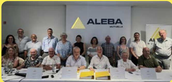
GENERAL MEETING OF MUTUELLE DE L'ALEBA